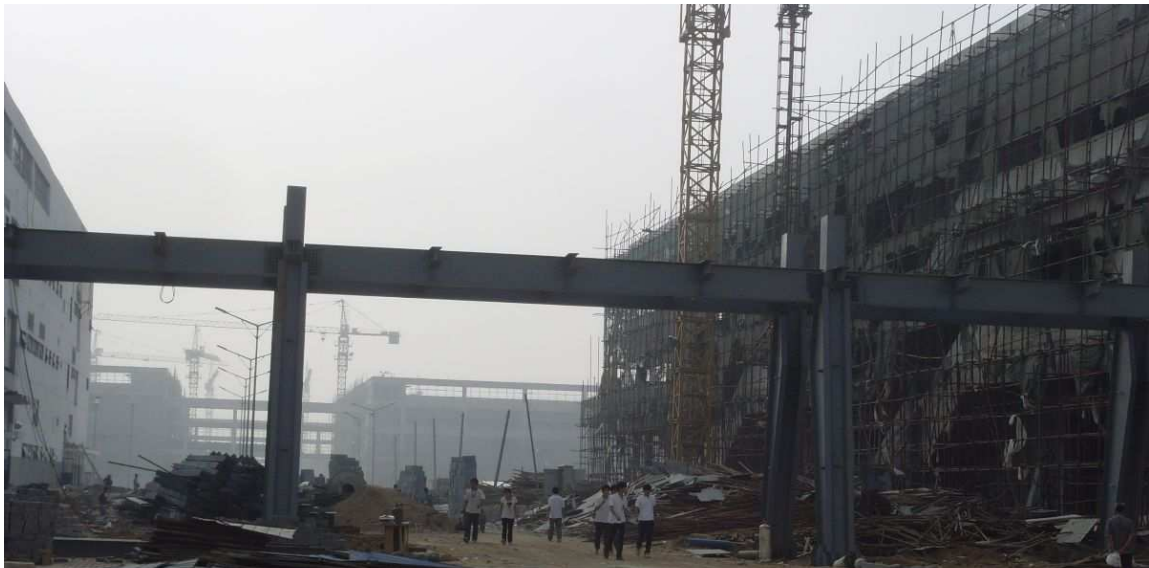
Foxconn's campus in the Airport Zone, Zhengzhou, provincial city of Henan