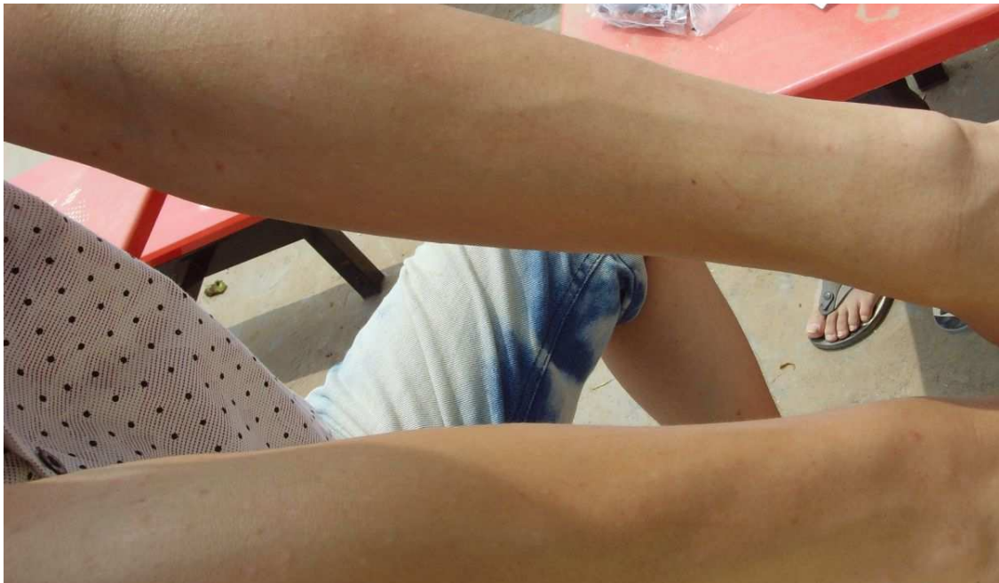
A worker shows scratches on his arms, which resulted from operating a machine a day before. The marks were more obvious when he left the factory, he said.

Another interviewee from the metal processing department shows his forearms, which are full of scratches. He plans to leave the factory soon due to the harsh conditions there.