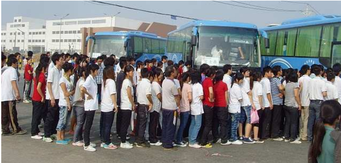
Night shift workers queue up for buses back to the dormitory. Sometimes, they have to wait under the hot sun or heavy rain.

There are limited company buses, and they have strict schedules. Sometimes when workers do not have overtime work, they have to wait an hour for the bus. On rainy days, the workers even have to queue up outdoors under heavy rain.