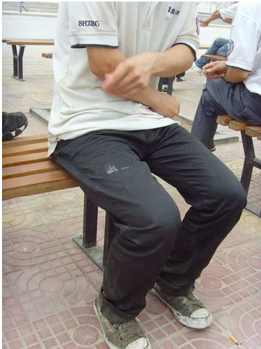
The dirty shirt and shoes are resulted from the "cutting fluid" in the metal processing department.

Besides unpaid overtime work, workers are required to attend unpaid work meetings. Most of the interviewees in Zhengzhou report that they have to arrive at the factory 20 minutes before the work shift begins. Meetings after work shifts last from 5 to 30 minutes.