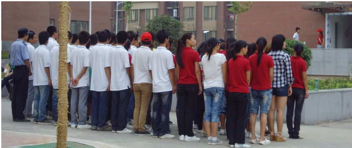
New workers line up for the announcement from a supervisor in Yu Kang Dormitory.

A majority of the workers are not satisfied with the quality of the food. “I can hardly find the meat in the dishes. Even if I order a chicken leg, it is as small as the leg of a sparrow,” a male worker said. “It seems that there are many dishes provided in the canteen that are tasteless, and the portions are quite small,” another male worker said. In the Airport Zone, the capacity of the canteen cannot meet the demands of workers. Some workers have to queue up for 20-30 minutes in the canteen. If they arrive at the canteen late, they can only get a very small portion of food. It makes them frustrated.