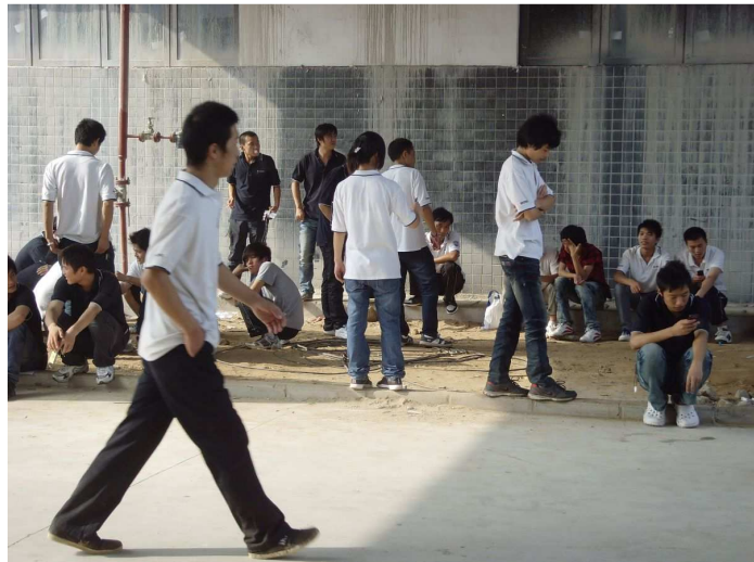
Workers do not have chairs to sit on in the open area of the campus. They can only sit or squat on the floor.

The production site in the Processing Zone is a temporary site that was offered by the local government a month after the contract was signed between the government and Foxconn. The permanent site for Foxconn is designated in the Airport Zone. While the construction work on the plants is still in progress, Foxconn has put some of the plants in operation. Basic facilities like canteens and food stores are not ready. Workers can hardly find a place to wash their hands after work. Dust flies around on the construction site and there is flooding during rainy days.