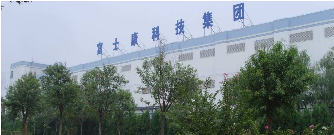
The temporary production site of Foxconn in the Economic Processing Zone, Zhengzhou.

Foxconn announced its plan for relocation to inland provinces after the spate of suicides in Shenzhen last year. Henan provincial government was the first province to attract such investment from Foxconn after the "13th jump" in 2010. Production commenced in August, 2010, only a month after the conclusion of the contract. The government has provided much assistance to Foxconn, including workers' recruitment and preparation of the production site. The Chinese media reported that about 100,000 vocational school students in Henan province were sent to Foxconn plants in Shenzhen for 3-month internships last year. Some student workers even disclosed that they were forced to work for Foxconn or face punishment by their schools. 3 With the support from the government, the workforce in the factory has reached 52,500 within a year. 4 And it was reported that the production capacity for the iPhone at the Foxconn factory in Zhengzhou soared to 100,000 per day. 5