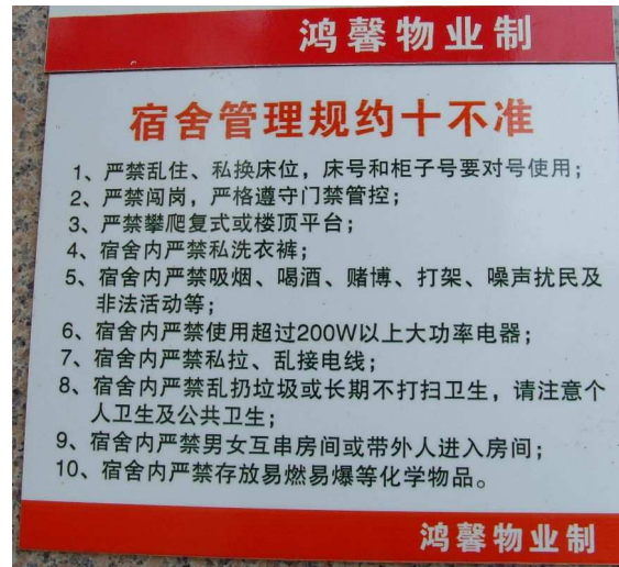
10 rules are listed at the entrance of the dormitory building.

At the entrance of Yu Kang Dormitory, researchers observed workers bringing electric fans to the dorm. Despite the basic facilities not being ready, Foxconn is having workers live in Yu Kang Dormitory. The rooms are supposed to have air-conditioners. However, the air-conditioners have not been installed yet. Therefore, workers have to buy fans with their own money. “A number of