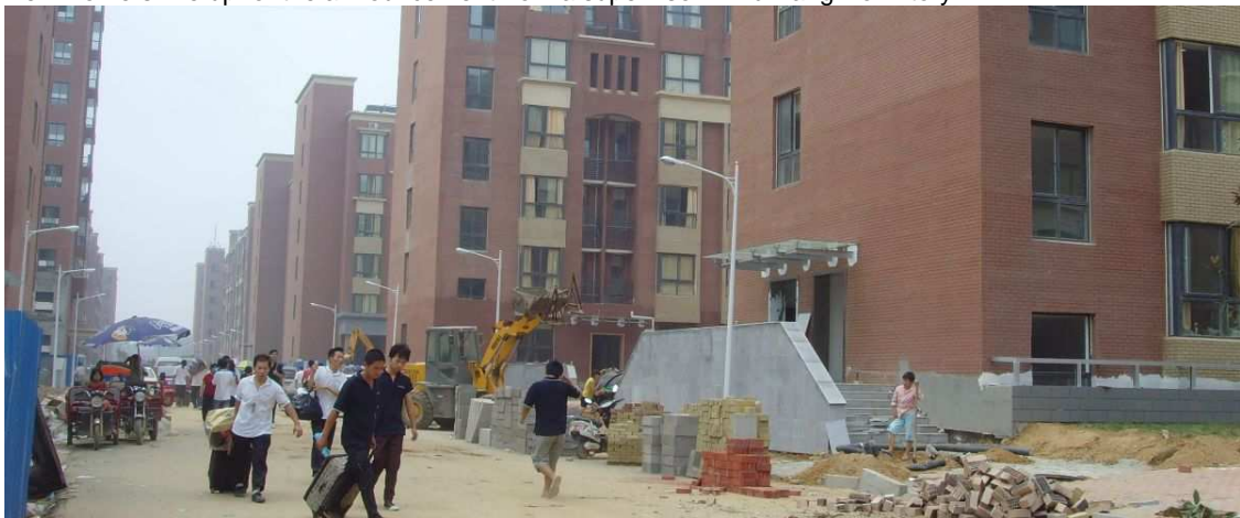
Yu Kang Dormitory is still under construction.