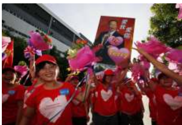
Love me, love you, love Terry

At the time, all 20,000 Foxconn participants stood up and chanted slogans, orchestrated by company organizers. A high-level manager loudly exhorted the young people: “Treasure your life, love your family!” 157 Most importantly, he shouted: “Let us care for each other to build a wonderful future.” 158