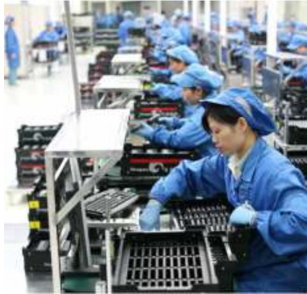
Foxconn workers on the assembly line

Chinese manufacturing wages as a percentage of US wages, 17 compared to those of Japan and East Asian Tigers like South Korea and Taiwan in the early years of their economic takeoffs, have remained consistently low. Economists Erin Lett and Judith Banister (2009) estimated that the average hourly compensation costs of China's manufacturing workers in 2006 was only US$0.81. 18 The Economist stated that as of July 2010, the Chinese migrant workforce "is still cheap...just 2.7 percent of the cost of their American counterparts." 19 Based on government