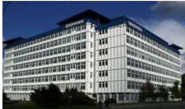
Foxconn Factory, Shenzhen

We can interpret Foxconn employees as having killed themselves to protest a global labor regime in which China provides the cutting edge. Under the reform and open-door policy, China’s export-oriented economy proved it could deliver economic growth.