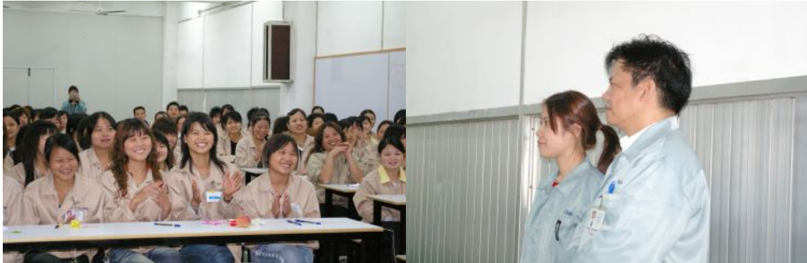
Chicony workers actively participated in worker training (Left); Chicony managers also attended some training sessions (Right).

Through the independent hotline, CWWN received grievances expressing a board range of concerns ranging from difficulty workers encountered when attempting resignation to occasional non-provision of hot water in dormitories.