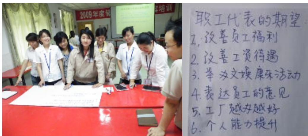
April 17, 2009—Chicony worker committee members shared their expectations about building a well-functioning worker committee.

In April 2009, CWWN trainers initiated discussions with the worker committee members about the representative role of a worker organization. The 30 trainees collectively set forth six major goals about their work: (1) to improve employees' welfare, (2) to improve wages and benefits, (3) to arrange cultural and entertainment activities, (4) to express workers' opinions, (5) to add value to the factory, and (6) to enhance oneself's abilities as a committee member.