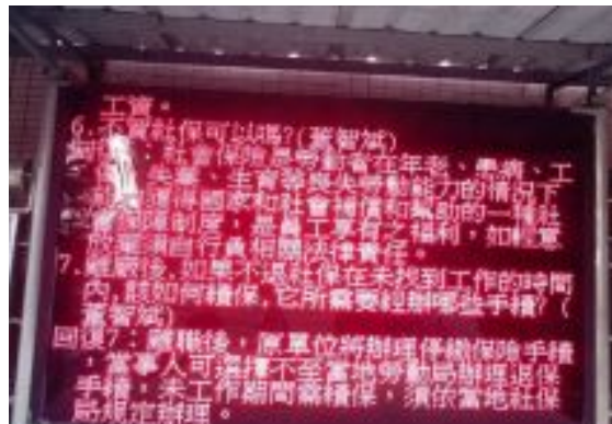
Chicony posts the workers' frequently asked questions and answers on its LCD bulletin boards.

Meanwhile, Chicony installed a central heating device to provide all workers with hot water in their living zone. Workers welcomed the new facilities with applause.