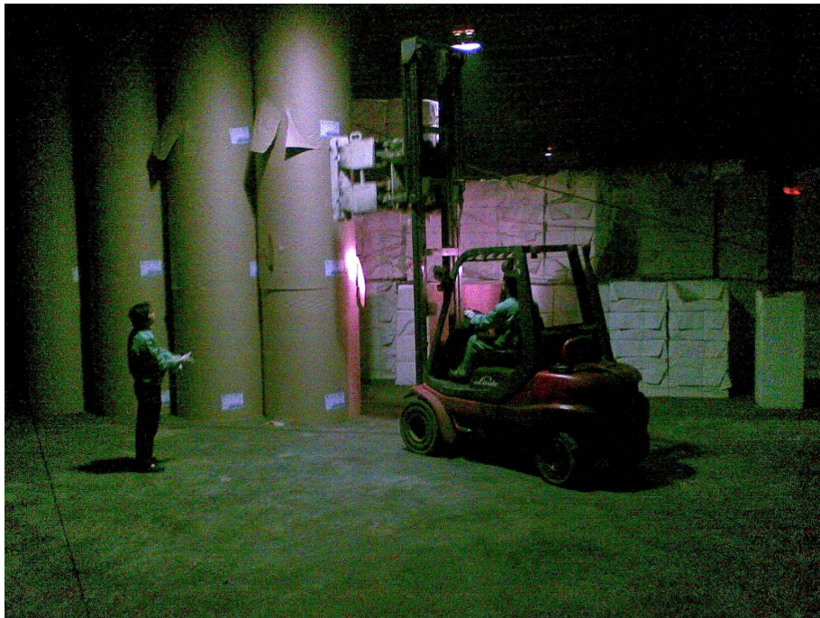
Picture: Warehouse of the Nine Dragons Taicang Factory

The monthly wage plus overtime pay of a formal worker at the Taicang Factory is about 1,800 yuan, 500 yuan higher than the dispatched workers. However, whether a formal worker or a dispatched worker, the wages are withheld for one month; in addition, no detailed pay slips are issued. The interviewed workers said that they had no clear idea about how the wages were calculated.