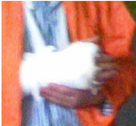
Picture: A Nine Dragons worker in Dongguan Factory got injured with his hand

The interviewed workers stated that the working conditions of Nine Dragons Dongguan Factory were extremely adverse. Work injuries take place very often. There is a popular saying among workers in Nine Dragons: “Injury happens monthly; death happens quarterly” . The interviewed worker told the researcher, “You may be hit by a forklift vehicle at the raw materials department, or hurt by iron wires; or killed by paper making machine 7 or a falling stuff in the production department. It is horrible!” The worker said that all the injured workers were sent to Mayong Hospital. The surgery unit and orthopedics department of the hospital are usually occupied by the Nine Dragons workers. The researchers visited the Mayong Hospital and found that each floor had two or three security guards. Visitors were not allowed to enter unless telling exactly the name of the patients to be visited, the sickroom number and the bed number. Mayong Hospital was heavily guarded, which is very much different from other hospitals in Dongguan.