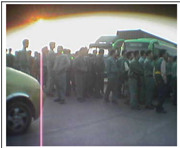
Picture: the Dongguan Nine Dragons workers put their photos of strikes onto the internet

Such practice of treating auxiliary workers as 'slavery-alike people' is not only an infringement upon their rights but also a personal insult to them. This is the destiny lived by the auxiliary workers at Nine Dragons under the guise of the so-called 'freedom of employment'.